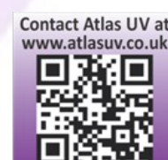
QR code screen