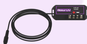
4-20 mA Module (used with UV sensor)