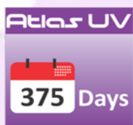
Lamp life remaining