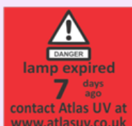
Lamp change warning