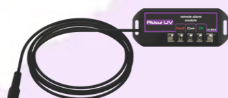
Volt Free Contact Module