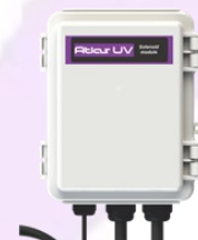
Solenoid Connection Module