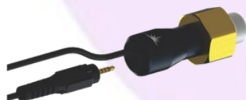
UV Sensor Module